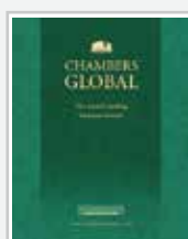
Chambers Global 2018